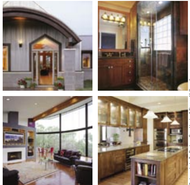
Award Winners, clockwise from top left: Entire House, Residential Bath, Residential Kitchen, Home Theatre & Media Room

Congratulations to all the architects, designers, project managers and carpenters who worked on these projects. A special thanks goes out to our wonderful clients who allowed us to photograph and submit their beautiful projects for these awards!