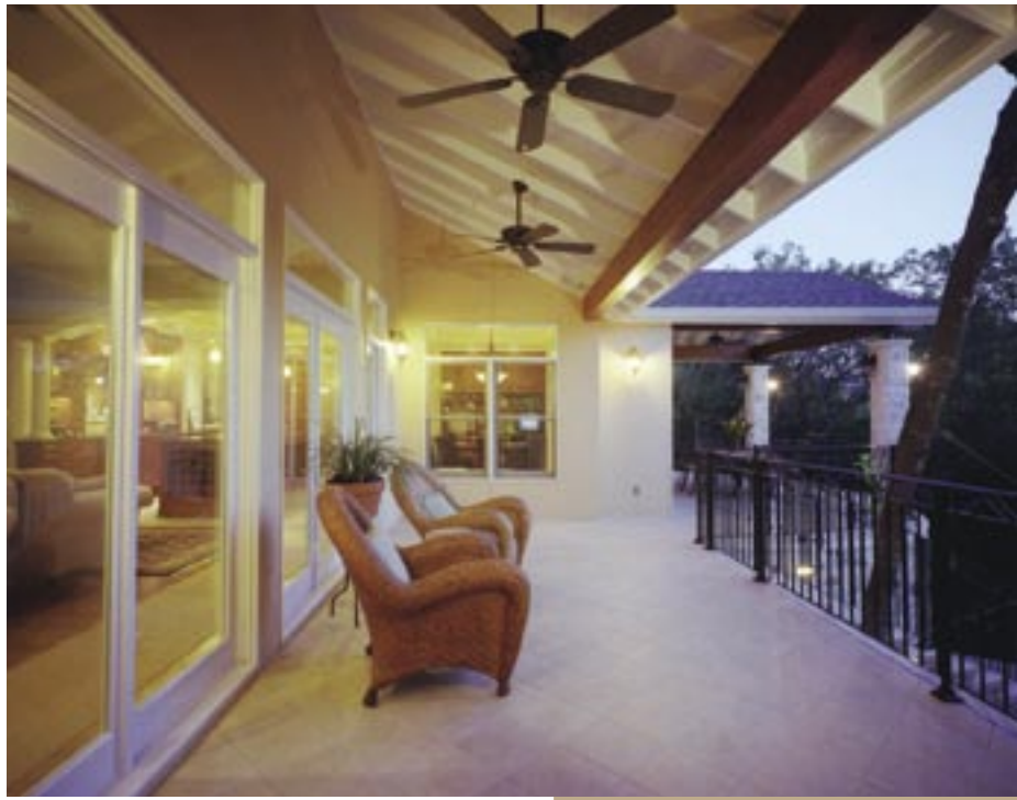
(Left to Right) Picture 1: Open on three sides, a rustic porch offers good airflow and sweeping views of the countryside. Picture 2: A long, cool porch opens off of a well-used family room as well as a playroom and dining room; patio doors connect inside and outside.

In this same spirit of summer contemplation of porches, we asked our principal architect, Stewart Davis, what basic rules of porch design he has found to be helpful in the interest of aiding those who are considering a porch project.