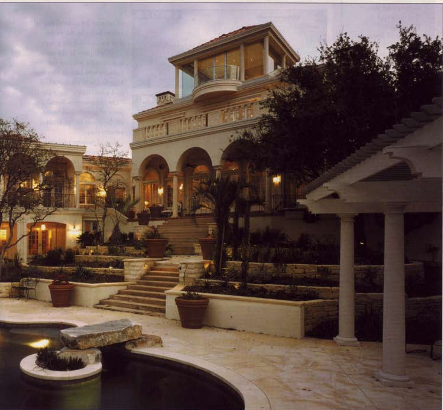
R. GREG HURBLEY, INC.