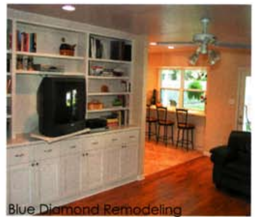
Blue Diamond Remodeling