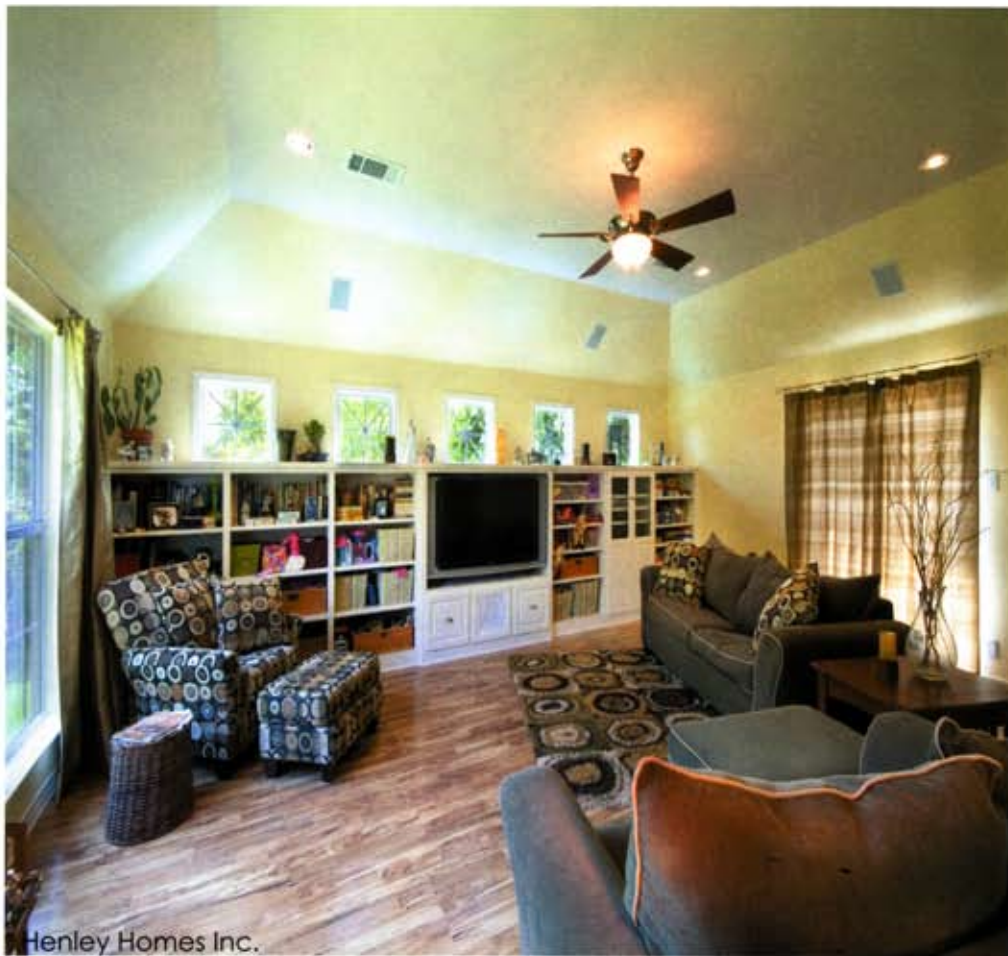
Henley Homes Inc.