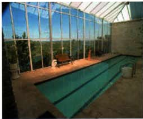
The Deck Before...

(Bottom Left: Before Bottom Right: After)